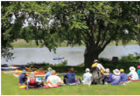
Some visitors arrive by water!