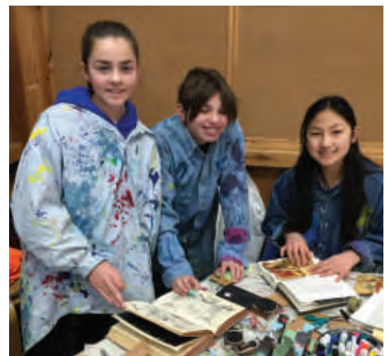
It was an evening of altered book mania for this group of Girl Scouts.