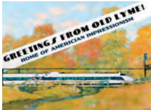
Artist and activist Robin Breeding has been combining impressionistic images of the picturesque Old Lyme landscape with jarring images of high speed rail for SECoast to invigorate community involvement in this project.