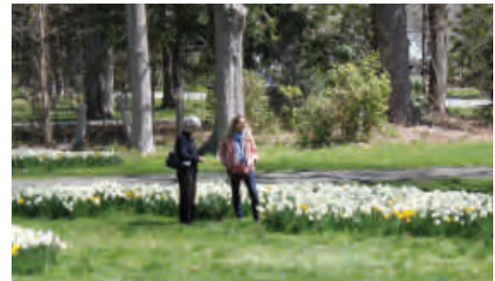
Each year the drifts of daffodils in the Woodhead Memorial Garden invite visitors to celebrate the promise of spring.