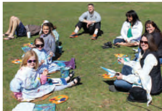
Discovery Sundays are fun for the entire family—artists and sun-worshippers alike!