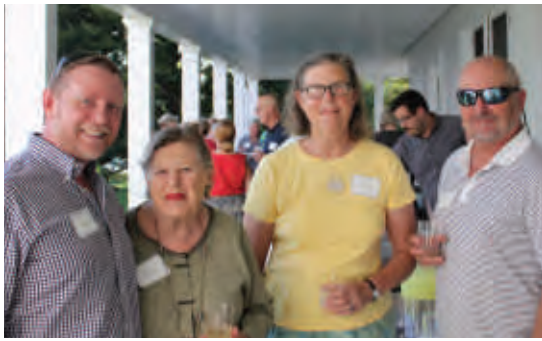
Every year volunteers give 7,000 hours of time and talent to the Museum in every department and we appreciate every minute.