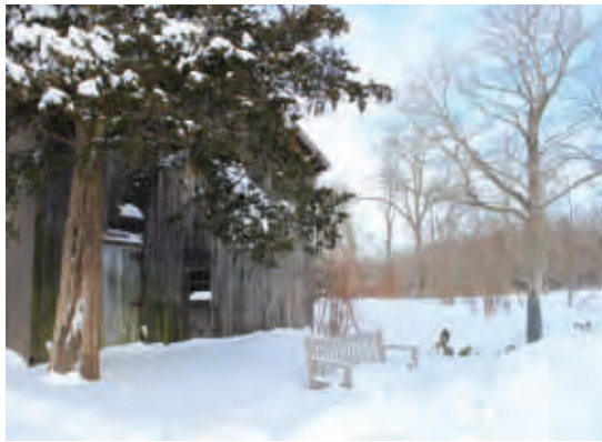
No one will forget the winter of 2015! Despite bitter temperatures and feet of snow, the site's quiet beauty and serenity still captivates.