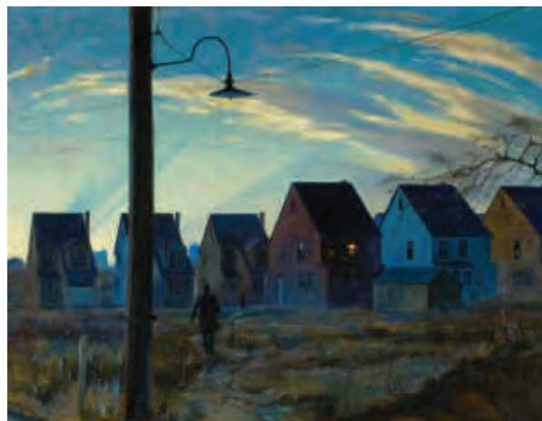
Martin Lewis (1881–1962), Dawn, Sandy Hook, Connecticut , circa 1933