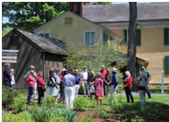
Group tours aren't just for kids, each year alumni associations, museum groups, and other cultural travelers gather to tour the exhibitions, historic Florence Griswold House, and grounds.