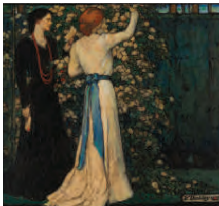
Violet Oakley, June , c. 1902. Pennsylvania Academy of the Fine Arts

Organized by the Pennsylvania Academy of the Fine Arts, The Artist's Garden: American Impressionism and the Garden Movement, 1887-1920 is the first exhibition to situate discussions of the growth of the Garden Movement and American Impressionism within the politics of the Progressive Era—a period known for both a surge in nationalism and growing anxieties about immigration, urbanization, and women's suffrage. From June 3 through September 29, paintings, sculpture, and stained glass blend with prints, books, and photographs to explore how art, literature, and social theory