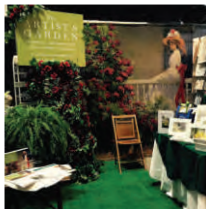
Museum staff reached out to over 2,000 people at the Connecticut Flower Show.

Staff members Nicole Wholean and Ted Gaffney volunteered their time to judge Connecticut History Day contests. These young regional