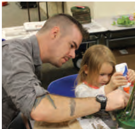
Top: Lyme Academy College of Fine Arts students create a “pop up” exhibition. Bottom: Outreach program at the Naval Subbase Library.