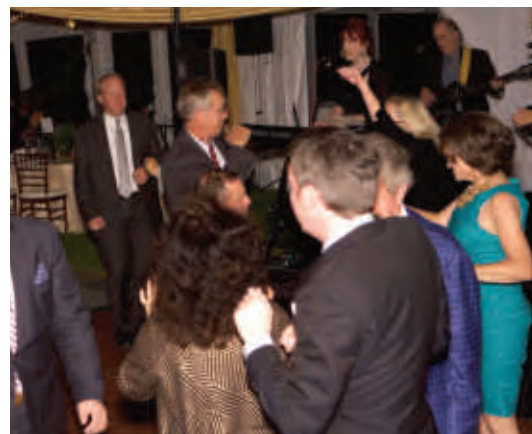
Eight to the Bar had everyone dancing at last year's Benefit Auction!