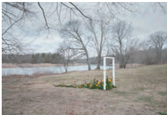
Contemporary fine art photographer Adrien Broom alludes to times past and places unseen in her series of "Portal" images. She will return to the site throughout the year to construct alternate scenes to be viewed through this gateway. The scenes hint to the timeless of the grounds and possibilities just beyond our sight.

Please read more about the artists and exhibition on the Museum's website and follow on Facebook for updates and photos of their progress.