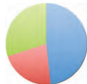
OPERATING REVENUE & SUPPORT