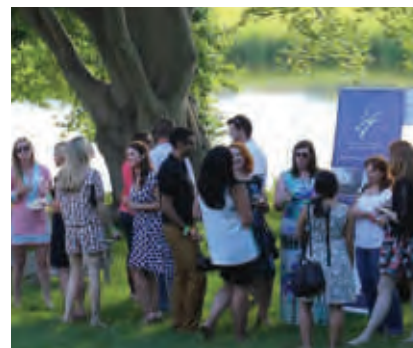
Last summer's party was a hit for the 21 to 39 crowd.

Bring your friends and meet new ones! Tickets are $15 in advance (until June 23) or $25 at the door. Casual garden party attire recommended. For more information, please contact DeeDee at (860) 434-5542 x122.