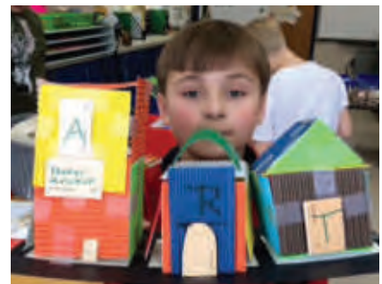
Happy art maker at Lyme Consolidated School.