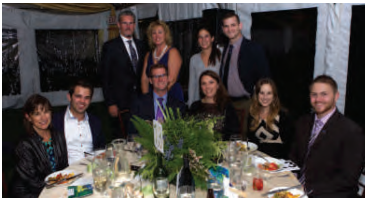
Bouvier Insurance knows that the Annual Benefit and Auction is a night of friends, food, and festivities!

All proceeds from this year's highly-anticipated gala benefit the Museum's education and outreach programs for all ages.