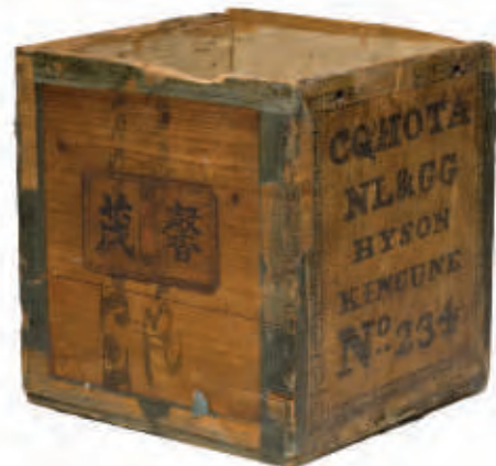
Unidentified Maker, N.L.G.G. Tea Box, circa 1844