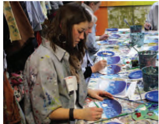
From scherenschnitte to collage and everything in between, Art • Bar participants gather with friends to learn a new skill.