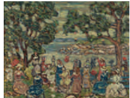
Maurice B. Prendergast, Promenade , c. 1915-18. Pennsylvania Academy of the Fine Arts

Afterwards, we'll enjoy a festive reception for the opening of The Artist's Garden: American Impressionism and the Garden Movement . This is your invitation to the Members' Reception. We hope you can join us. Kindly RSVP (acceptances only) to 860-434-5542 ext. 122 or DeeDee@flogris.org .