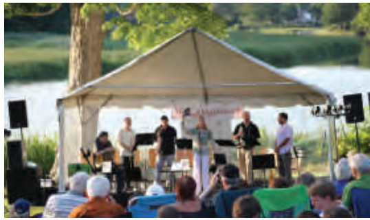
2015 marked the 25th anniversary of Musical Masterworks. Initially started as a partnership with the Museum, it seemed fitting that the Midsummer Festival concert celebrate the group's milestone.