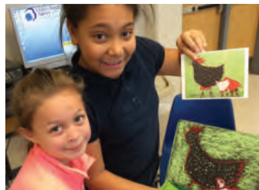
These kids aren't chicken about art. They love Museum outreach programs.