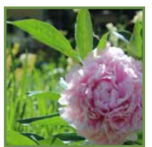
Paeonia lactiflora Peony Perennial :: (m)