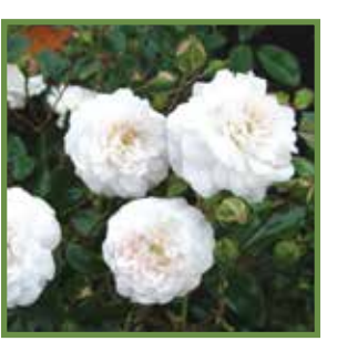
White Pet Polyantha Roses : (m)