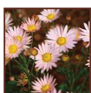
Dendranthemum Sheffield Pink Chrysanthemum Perennial; Will spread :::/m)