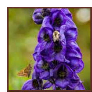
Aconitum napellis Garden Monkshood Perennial; fertile soil : (*): (w)