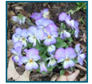
Viola Pansy Annual