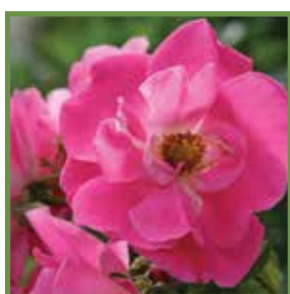
Rosa William Baffin Kordesii hybrid Roses : (m)