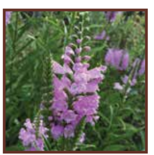
Physostegia virginiana Obedient Plant Perennial; Will aggressively spread