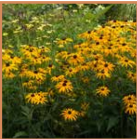
Rubekia fulgida Black-Eyed Susans Perennial