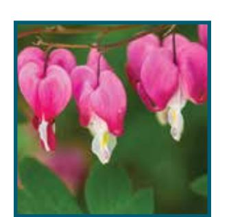
Dicentra spectablis Bleeding Heart Perennial; humus soil ∴ / (m)