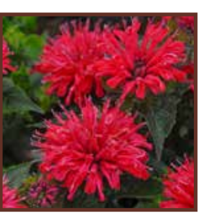
Monarda didyma x fistulosa Common Red Beebalm Perennial; fertile soil :: - : : / (m)