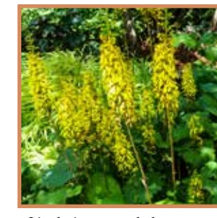
Ligularia stenocephala "The Rocket" Bigleaf Goldenray Perennial (: / (m)