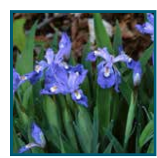
Iris cristata Crested Iris Perennial ( '(m)