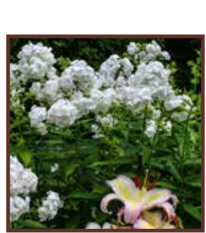
Phlox paniculata David Phlox Perennial; fertile soil :: (m)