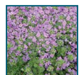
Thymus serphyllum "Elfin" Thyme Perennial; loose soil ∷ (m)