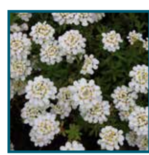
Iberis sempervirens 'Snowflake' Candytuft Perennial ∴ (m)