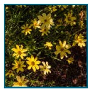
Coreopsis verticillata Threadleaf Coreopsis Perennial ;; (d)