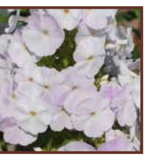
Phlox Carolina 'Miss Lingard' Garden Phlox Perennial; fertile soil :: - : : (m)