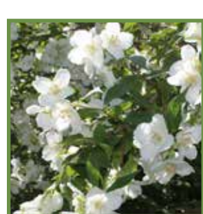
Philadelphus coronarius Sweet Mock Orange Deciduous Shrub :: :: (m)