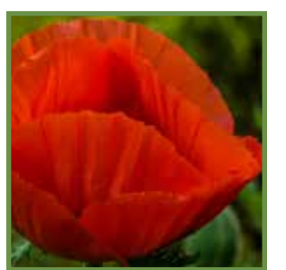
Papaver orientale Poppy Perennial :: -: (m)