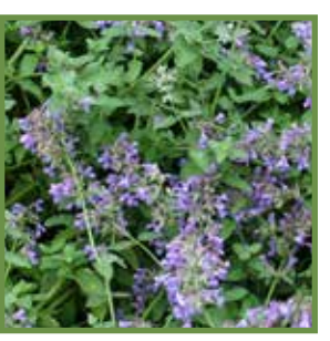
Nepeta subsessilis Catmint Perennial through July ∴: / (m)